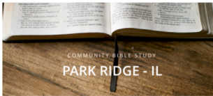
Park Ridge Park Ridge Community Bible Study class will be studying:

Family Ministry Registration for the 2023 - 2024 ministry year is now open. Click on the link in the info hub at www.southparkchurch.org/info to register so we have you and your child's updated information.